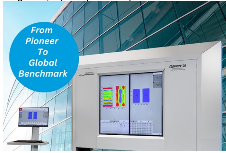
Image 1: Osprey®25 by LiteSentry – From Pioneer to Global Benchmark